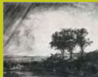
Rembrandt van Rijn The Three Trees , 1643 etching, with drypoint and engraving