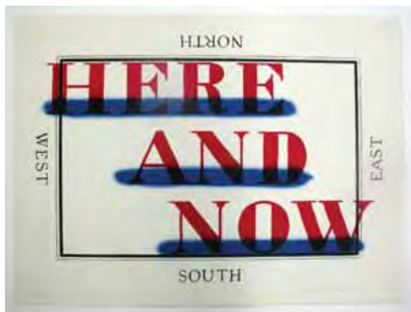
Ed Ruscha (American, born 1937) Here and Now , 2008 lithograph, 17 x 23 inches (43.2 x 58.4 cm) publisher and printer: Gemini G.E.L. LLC, Los Angeles edition of 75

This festive evening offers collectors a first look at the Fair's many exquisite offerings before it opens to the public. This year's benefit print has been created by Ed Ruscha and is available to those who purchase a Lead Benefactor or Benefactor ticket (subject to limited availability).