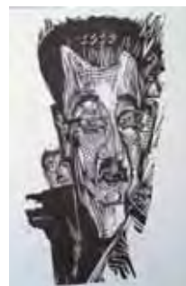
Ernst Ludwig Kirchner Dr. Ludwig Binswanger, 1917-18 Woodcut