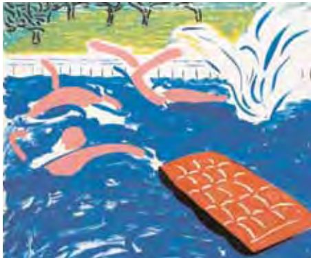
David Hockney Afternoon Swim , 1980 lithograph edition of 55