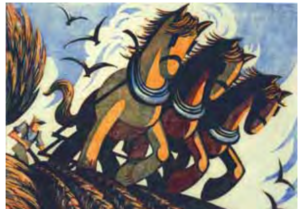
Sybil Andrews Tillers of the Soil , 1934 linocut