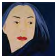
Alex Katz Black Scarf, 1996 Screenprint Edition of 75

Presented by Cannonball Press; Saturday November 1st, 6pm-midnight, Sunday November 2nd, 12pm-6pm; Supreme Trading, 213 N 8th Street, Brooklyn, NY; www.cannonballpress.com