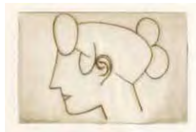
Elie Nadelman Female Head , 1920/1952 drypoint