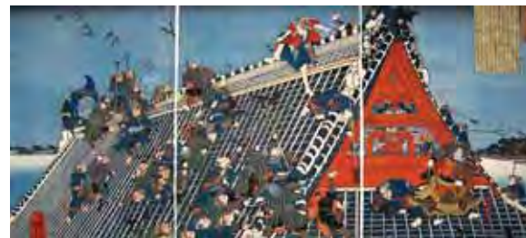
Utagawa Kuniyoshi Inuzuka Shino surrounded on the roof of the Horyukaku. (detail) c1836-37 woodblock

Drawing Babar: Early Drafts and Watercolors (includes prints) Tuesday-Thursday: 10:30am-5 pm; Friday: 10:30am-9pm; Saturday: 10am-6pm; Sunday: 11am-6pm 225 Madison Avenue at 36th Street; 212.685.0008